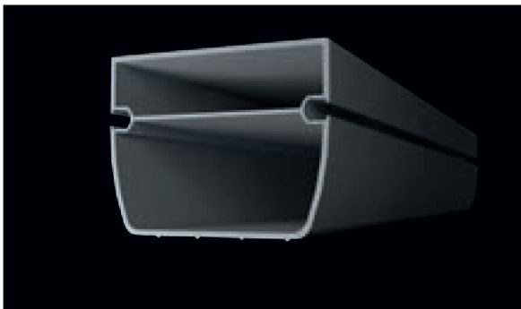
KUMAŞ ALT PROFİLİ Fabric Bottom Profile