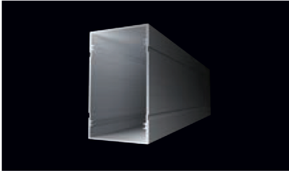
AYAK PROFİLİ Foot Profile