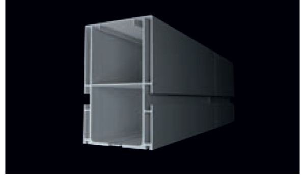
SILVER RAY PROFİLİ Silver Ray Profile