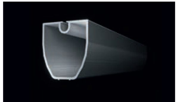
KUMAŞ ALT PROFİLİ Fabric Bottom Profile