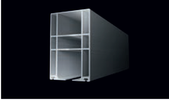
GOLD RAY PROFİLİ Gold Ray Profile